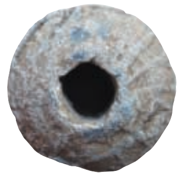
Figure 9: Spindle whorl.

A spindle whorl (fig 9) was the only other interesting find. Again, a good signal and deep at around 20cm.