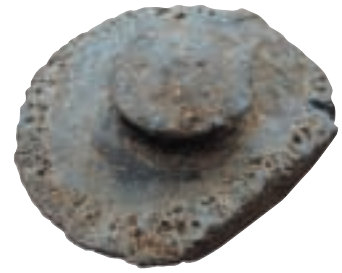
Figure 2: Lead 'lid' yet to be positively identified. Any Ideas?

The X-Terra was switched on set up. My initial set up was: Sensitivity at 19, Discrimination at -3 and noise cancel left at 0. The noise cancel is often called frequency adjust on other detectors and is used to minimise interference from electrical sources such as other detectors or pylons etc. Ground Balance was set as per the instructions. Simply bob the coil up and down and alter the control until both high and low tones 'null', in this case at 9. I began to search and almost immediately was the first signal with an ID number of 25. This turned out to be a small copper-alloy fragment folded in two and dug from a depth of 7cm. This was encouraging as it has a medieval look to it. The next signal was a quieter but solid signal. This turned out to be a lead object measuring 60mm diameter. See fig 2 (this does not seem to be a weight and looks like a lid but has a convex underside. Any ideas?) from a depth of around 30cm. This impressed me and I began to feel this detector was a serious piece of kit. I wandered up and down the 'enclosure' enjoying a steady finds rate though only a few are worthy of note. Early on I found a small aluminium-alloy