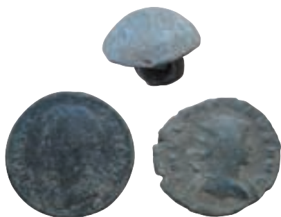
Figure 7: First three finds from the Mill field: Lead button, Charles II farthing & Antoninianus.

Beginning at the southern end of the field, I Ground Balanced the 'Terra' and made my