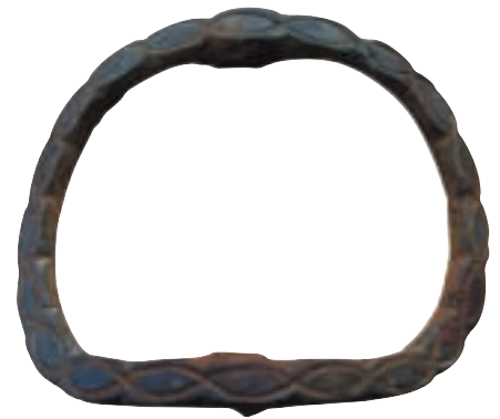
Figure 3: Nice 18th Century shoe buckle.

fragment, this was the first of many, as the whole site seems to be littered with these bits at various depths. I have no idea why this should be but from our point of view it was a useful test as I soon got to know them from their ID readings of between 29 and 33 apart from a couple of larger shallow pieces which gave a meter readings of 39 & 41.