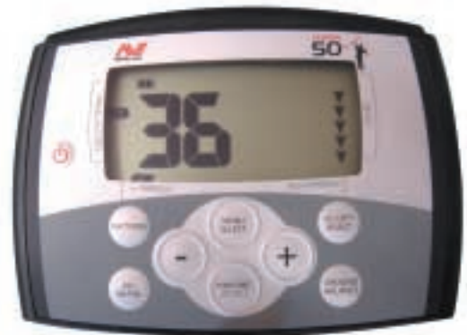
Figure 1: The Control Panel of the X-terra 50

All controls are the touch pad type and are as follows. (See fig 1)