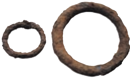
Figure 5: The two iron rings that fooled the X-terra 50 ID system.

but the X-Terra 50 was doing a good job of rejecting it. Massive lumps of iron gave a good signal and locked the meter on at 45. Again this is a problem for most detectors and the only way is dig, but the large area pinpointed is usually a giveaway.