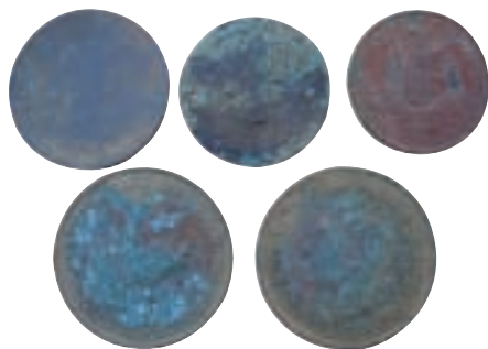
Figure 6: Pre-Decimal coins from the pasture field.

A week later saw me on my original intended site, a field called 'Mill Field' which has in the past thrown up coins and artefacts from roman to victorian (fig 6). I have detected here many times over the years and am usually guaranteed some interesting finds and even hammered silver turns up now and again.