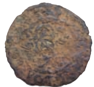
Figure 4: Very poor condition medieval Jetton.

A nice shoe buckle was dug from about 18cm (Fig 3). The ID of this was 31. Another interesting, though not a nice find (fig 4) was a jetton so poor it is hard to see that is what it is! This was not deep and the meter happily locked on at 24.